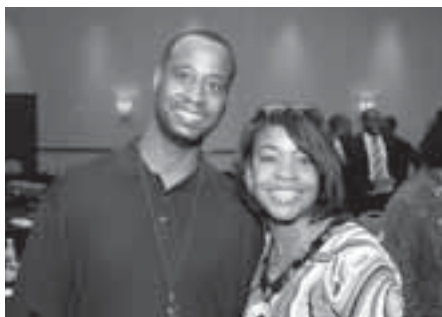
In November 2008, Chapter Presidents met in Phoenix for the fall 2008 Chapter Leadership Retreat.

"CASH/College Awareness Symbolizes Hope" youth mentoring program topped 100 participants. Chapter sponsored graduating seniors' tour of Historically Black Colleges and Universities.