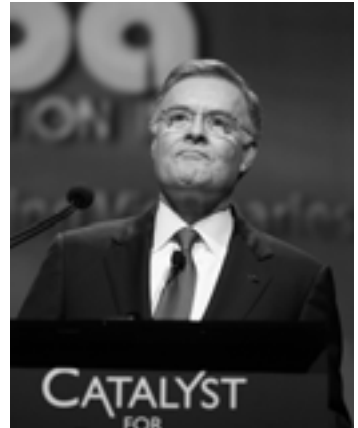
The 2008 Conference's Friday Luncheon Keynote, Bank of America Chairman and CEO Kenneth Lewis, was a topical speaker at the end of one of the most tumultuous financial weeks of the last year.