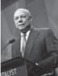
MBA of the Year General Colin Powell Former U.S. Secretary of State