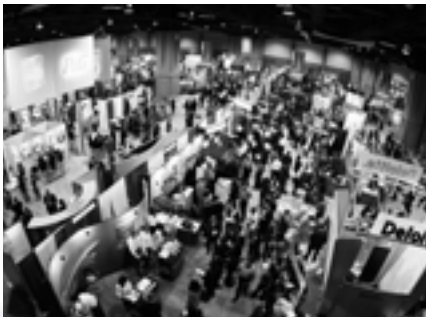
More than 400 companies recruited diverse talent on the 2008 Career Fair floor.