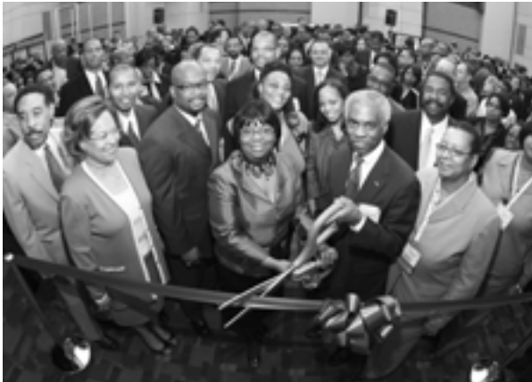
NMBBAA Board Members cut the ribbon at the opening of the 2008 Career Fair.

tured the NMBBAA Career Success Network SM (CSN) center, which provides onsite coaching, résumé feedback, and interviewing skills workshops. CSN was created in response to members and partners' demands for additional career skills building opportunities designed for recent graduates to high-achieving mid-career level professionals. NMBBAA Employment Network TM and Conference Job Match, a function of the employment network service, leverages web-based resources to help employers find and screen qualified candidates for management positions that require an MBA or advanced experience.