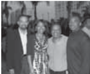
In March 2008, Chapter Presidents met in Los Angeles for the spring 2008 Chapter Leadership Retreat.