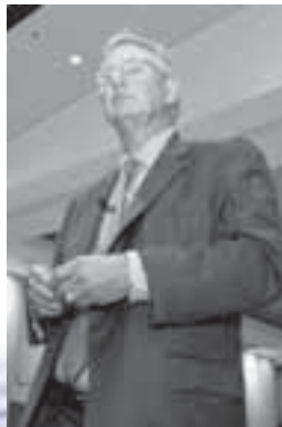
NBMBA Leadership Institute® keynote speaker Tom Peters.

The NBMBA Local Empowerment Initiative® makes elements of the annual conference accessible to local markets by providing workshops, sessions, employment and networking opportunities designed to help participants achieve their personal and professional objectives. The 2008 Local Empowerment Initiative was hosted by the Chicago,