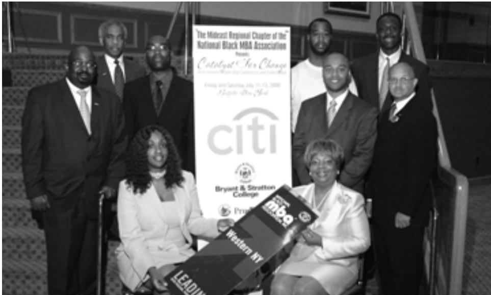
The MidEast regional chapters successfully collaborated on its inaugural Leadership Conference and Career. The group, which represents 12 markets, pledged to continue working collectively to add value to their communities.

Gathered with Cincinnati, Cleveland, Columbus, Dayton, Detroit, Louisville, Pittsburgh and Western New York Chapters at the first annual MidEast Regional Conference held in Buffalo, N.Y.