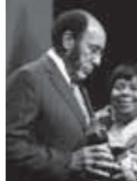
Entrepreneur of the Year Earl G. Graves Sr. Chairman & Publisher Black Enterprise Magazine

Winners of the Leaders of Tomorrow® Case Competition Columbus Chapter Students