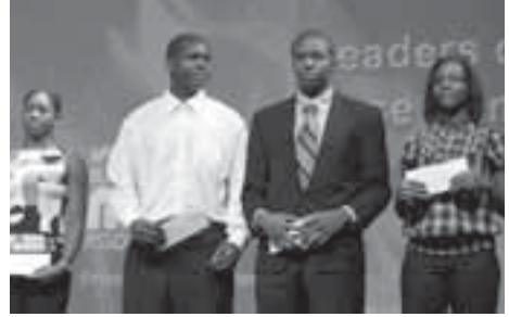
High School students from the Columbus Chapter won the 2008 Leaders of Tomorrow® National Case Competition, sponsored by ExxonMobil.

In 2008, NMBBAA launched a scholarship program for (LOT) students. Sponsored by Wal-Mart Stores, Inc., the Leaders of Tomorrow® Community Service Program – a first-time NMBBAA program – provided up to $1,000 to NMBBAA local chapters. LOT students participating in the 10 chapters that received the award planned and implemented a community service project that they carried out in their local communities.